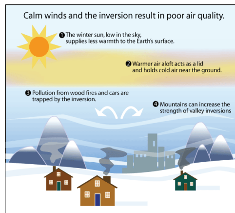
Figure 3.4-1 – Temperature inversions

On most days, higher altitudes mean lower air temperatures. This is because most of the sun’s energy is converted to sensible heat at the ground, which in turn warms the air at the surface. The warm air rises in the atmosphere, where it